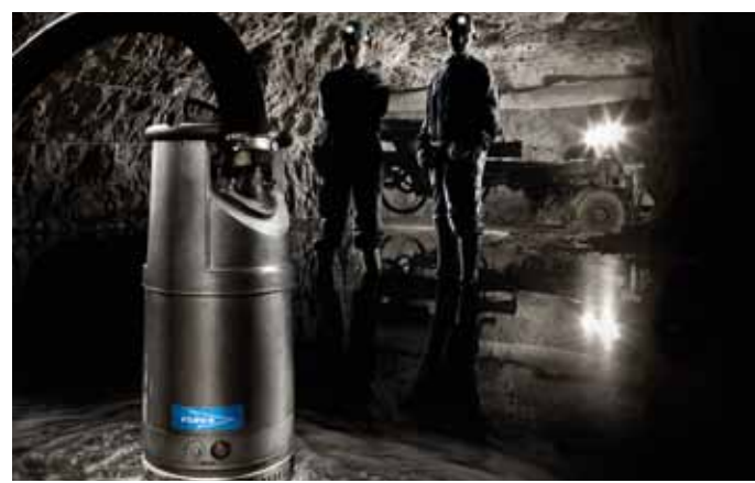
Mine Dewatering Pump