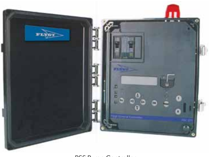
PSS Pump Controller

Best of all, you can order the pump as part of an all-inone package. That's a pump, plus a prefabricated pit, plus a pump controller in one competitive package – all from a single supplier.