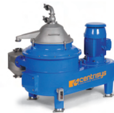
CDC SERIES Disc Centrifuges