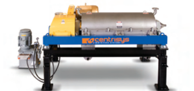
THK SERIES Thickening Centrifuges