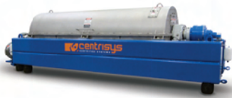
CS18-4 HC Centrifuge