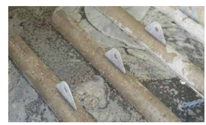
Completely submerged Iso-Disc® filter with 100% filtration area

The Alfa Laval AS-H Iso-Disc Cloth Media Filter provides continuous filtration even during backwash and maintenance. Individual filter elements can be individually monitored for throughput and quality, and can be removed for service with-